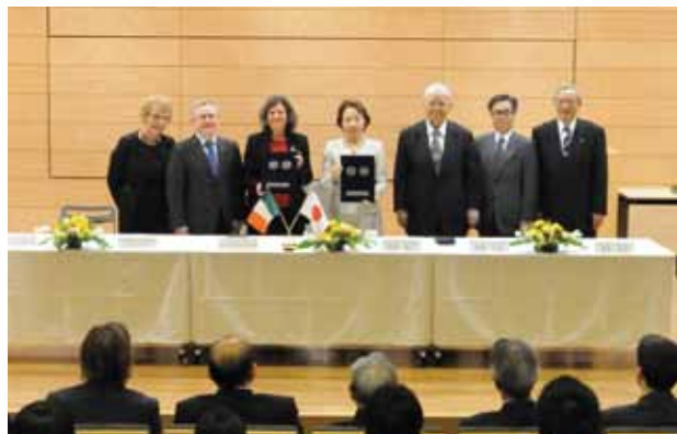
Finalizing the exchange agreement