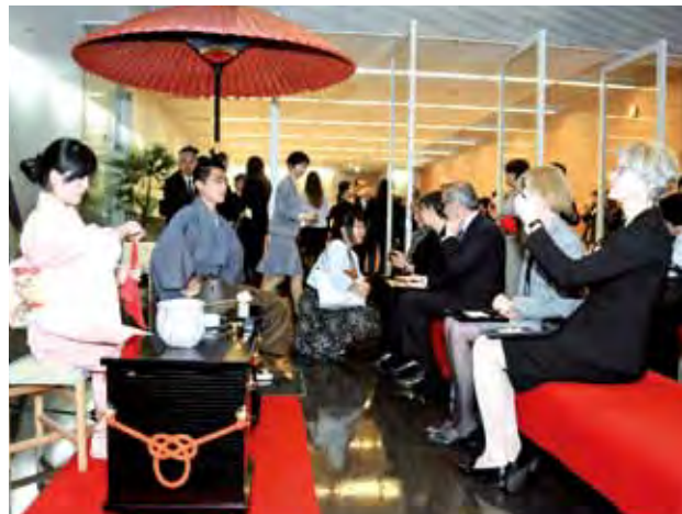
Enjoying Japanese tea during intermission