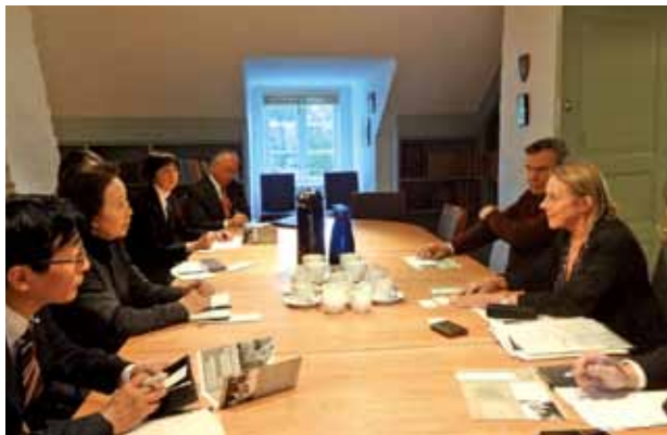
Meeting at the European Institute of Japanese Studies in the Stockholm School of Economics

It was decided that we will continue to exchange opinions and hold discussions regarding exchanges between the universities in the