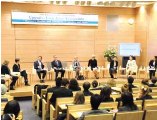
Discussion with all panel members