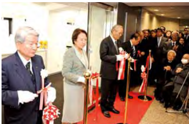
The ribbon cutting ceremony

The 5 th building consists of one below ground and five above ground floors with a total area of 1,400 square meters. The first floor houses the enrollment and public relations office and the parental support and alumni office. The 2 nd through 4 th floors will house a mini theater, seminar rooms, and study rooms. The 5 th floor will consist of guest rooms for mid and long-term visitors from our sister institutions abroad. The Tokyo Kioicho Campus was first opened in 2005. Other Josai University campuses include the Josai Junior College campus in Sakado and the Josai International University campuses in Togane and Awa. The Tokyo Kioicho Campus has many facilities to support student learning and job placement such as the Josai International Center for the Promotion of Arts and Sciences and the International Conference Room which function as a place for research and international exchange. At present there are approximately 2,000 undergraduate and graduate students enrolled at Josai.