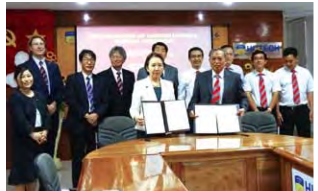
Exchange agreement signing at HUTECH