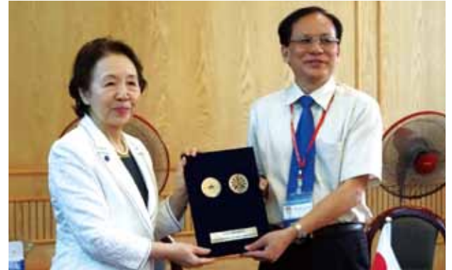
Signing the exchange agreement with UT-HCMC

As the second leg of their trip, the Josai delegation next visited Vietnam. The primary goals of their visit to Vietnam was to establish academic exchange agreements with four different universities and to introduce high school students and other members of the young generation to the appeal of Japan and Josai in an effort to instill the importance of "learning from Japan."