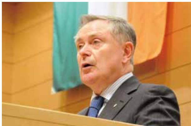
Minister Howlin gives his lecture