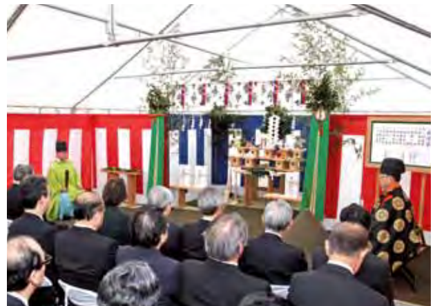
Groundbreaking of the Awa Global Village

With the construction of the AGV, Josai hopes to foster human resources in the field of tourism that possess a global worldview, while encouraging greater interaction with members of the local community.