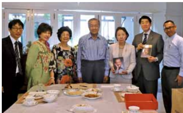
At Mr. Mahathir's residence