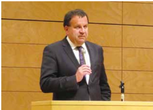
Minister Mládek delivers his lecture

The title of Minister Mládek's lecture was "The Czech Republic and Japan." With the Czech Republic as a core member of the EU, Minister