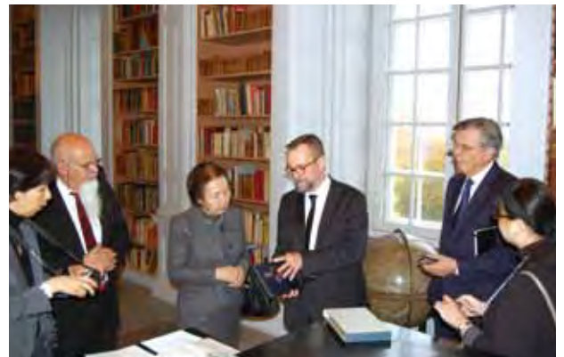
With writings of Harry Martinson's in hand at the CAROLINA REDIVIVA of Uppsala University

There are 12 libraries in the oldest university in Northern Europe. We were guided to the oldest library area, which is the main library area. A museum is located on the first floor of the building, exhibiting a number of valuable pieces, including a bible made of silver, a musical score of "Die Zauberflöte" by Mozart, etc. Other areas are modern browsing rooms for students, and many students were entering and leaving the areas.