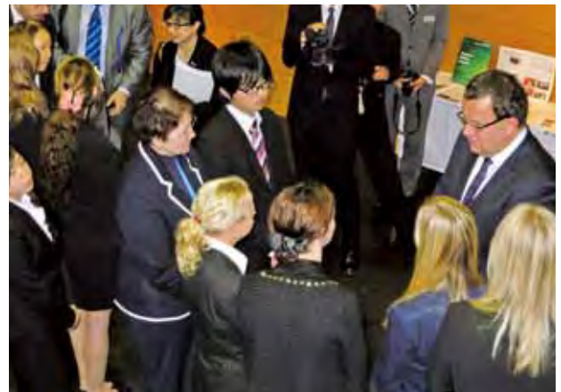
Minister Mládek meets with students

It is our hope that this visit from Minister Mládek will lead to even more productive exchange with the Czech Republic.