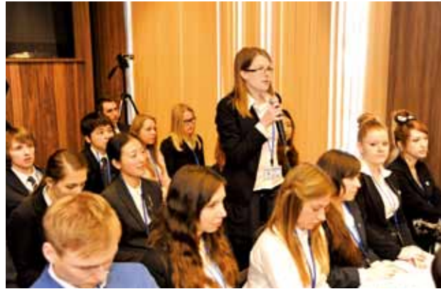
Lively Q&A session

This year, Josai invited 6 students from our sister universities in Visegrad Group, Masaryk University (Czech Republic), Eötvös Loránd University (Hungary), Warsaw School of Economics (Poland), Comenius University in Bratislava (Slovakia). As a whole, “Multicultural Coexistence in the Globalization Era” was set up as universal theme for any regions or countries. The conference was divided into three sessions, (1. Economic Implications of Regional Integration: Contrasting Responses to Increased Contacts and Exchanges. 2. Individual and Group in an Era of Cross-Border Migration. 3. The Challenge of Globalization to National Identity). This conference was the only event happening outside of the V4 countries that was recognized as promoting international relations and solving environmental issues by the International Visegrad Fund (IVF). Thus the IFV, which is administered by the V4 countries and which