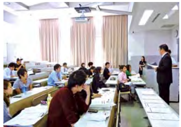
Program orientation at the Togane campus (9/26)