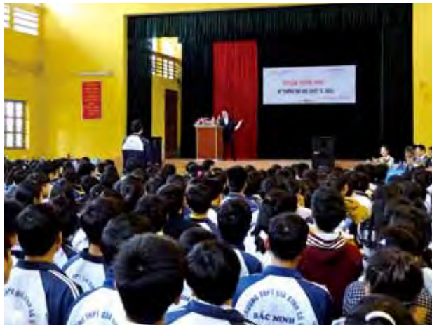
Presentation at Gia Binh First High School