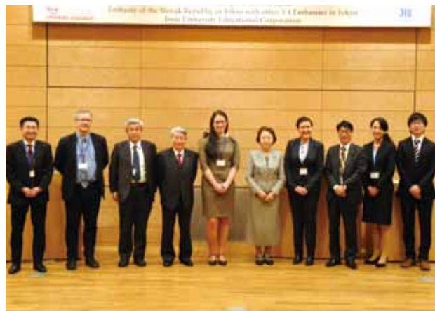
Picture of the panelists