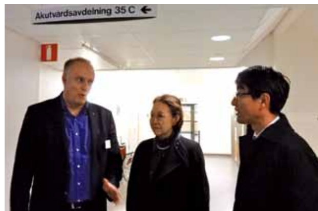
At the Uppsala University Hospital

Afterwards, we listened to the overview in the seminar room. They explained how each building has different departments and that this hospital especially excels at plastic surgery treatment, etc. After the explanations, a Q&A session was held in connection to the difference of the insurance system between two countries, including differences in medical cost and medical systems in Japan and Sweden, etc.