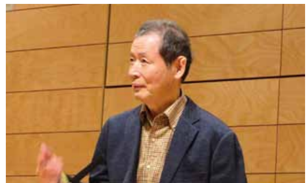
Mr. Karatani during his lecture