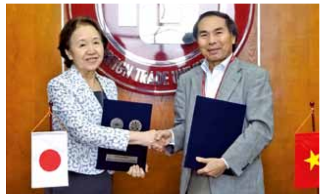
With FTU president