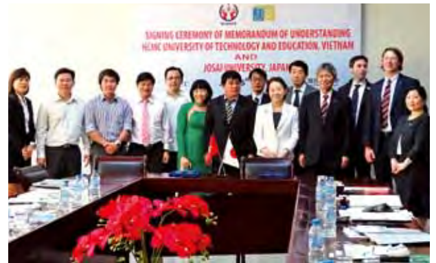
Commemorative photo at the signing with HCMUTE