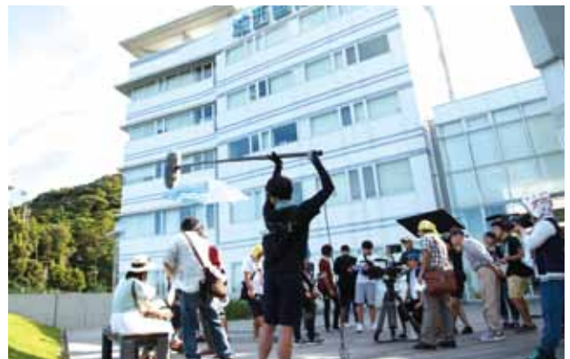
Filming in August

Nine student participants from Korea arrived in Japan on August 2, and filming took place from that day until the 12th, in Tokyo and in the Kamogawa area. The students hit it off immediately, and enjoyed a memorable time in Kamogawa in the heat of summer.