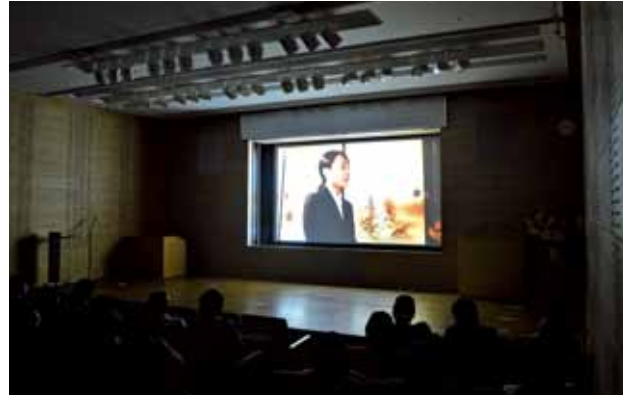
The film premiere