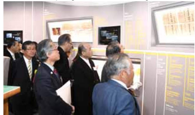
Participants tour the Founder's Room