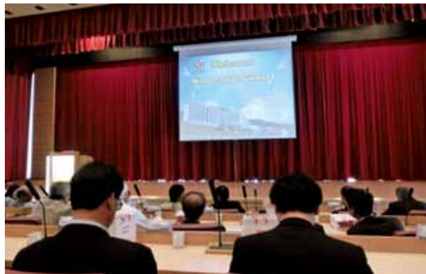
Visiting the Tamkang University Lanyang Campus