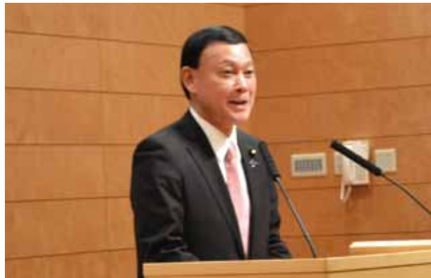
Keynote speech by Motome Takisawa, Parliamentary Vice-Minister for Foreign Affairs

The percentage of Polish people among the population of foreigners in the U.K. has increased recently, and, furthermore, the Brexit occurred. It was pointed out that under these circumstances, the East European countries, which are countries sending immigrants, are generating political protests from countries accepting immigrants. Moreover, the Central and East European countries see migrants entering Europe as immigrants, not as refugees, and they are not in the position to be officially accepted because they are seen as "illegal immigrants." This overlaps in many ways with Japan's situation and policies. In this sense, too, this seminar was very significant.