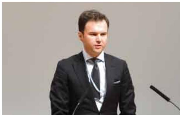
Keynote speech by Piotr Szostak, Chargé d'Affaires ad interim of the Embassy of the Republic of Poland in Tokyo