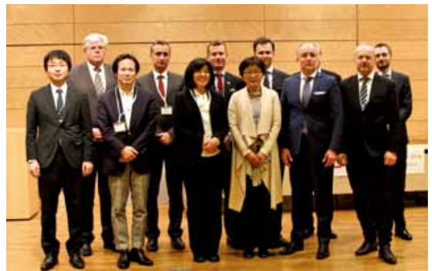
Commemorative photo of panelists