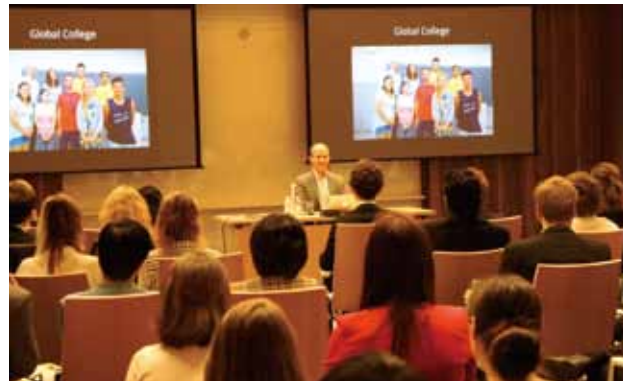
The Global Café