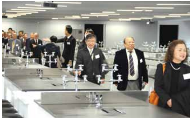
Participants tour a laboratory at the new building for the Faculty of Pharmaceutical Sciences