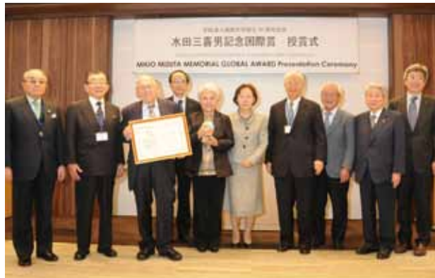
Commemorative photo with members of the Selection Committee

Mikio Mizuta also promoted education passionately with initiatives such as making compulsory education expenses a responsibility of the state and by providing subsidies for private schools. Josai University was founded in 1965 with the goal of "human formation by learning." The Mikio Mizuta Memorial Global Award embodies the spirit of the efforts to rebuild and redevelop Japan. The award was established with the aim of honoring all those who have, in their writings or activities, made remarkable contributions to the revitalization of the Japanese economy, society, and culture.