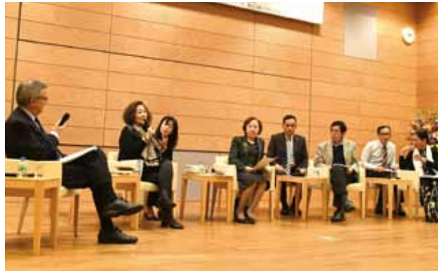
A scene from the "Poetry and Reality" session