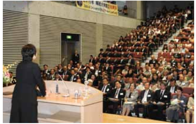
A view of the enraptured audience

Regarding her second experience of becoming the wife of a Prime Minister, she emphasized, “I learned that there are many voices which do not reach those at the top. Although I am sometimes called the ‘domestic opposition party’, my husband is the Prime Minister of all