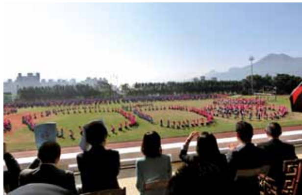
The opening event of the 66th Anniversary Ceremony on the fields at Tamkang University