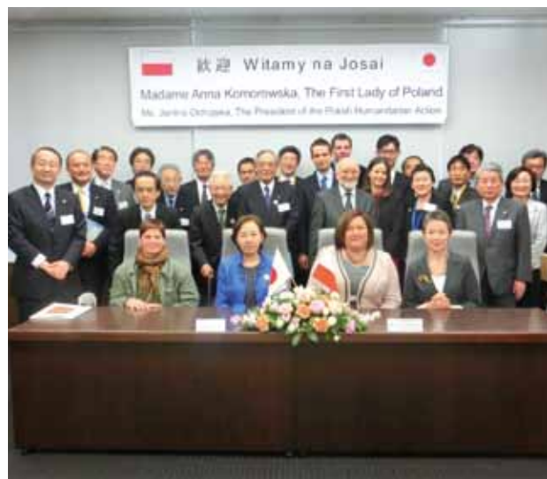
Commemorative photo with the group of the First Lady