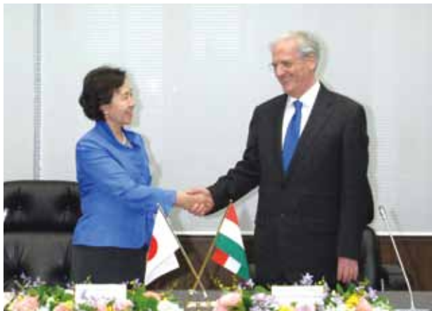
Greeting the Hungarian President Sólyom

of mutual exchanges between the University and the Republic of Hungary. Chancellor said that two former Hungarian ambassadors are affiliated with the University as visiting faculty members, teaching courses on Hungarian history and culture and then announced the introduction of a new scholarship as a way to honor the visit of the President. She also introduced the special lecture by the President, saying that its topic is especially relevant and timely for the current situation of Japan as the nation is in the middle of transitional period, looking for a new direction.