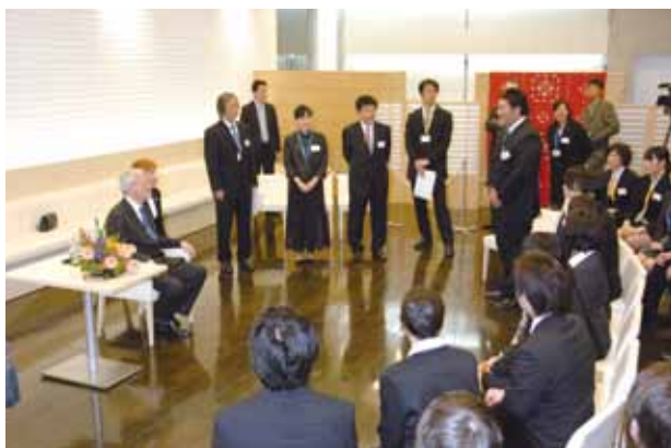
Conversation with the President