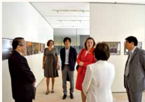
Ambassadors view the photography exhibition at the 3 rd building art gallery