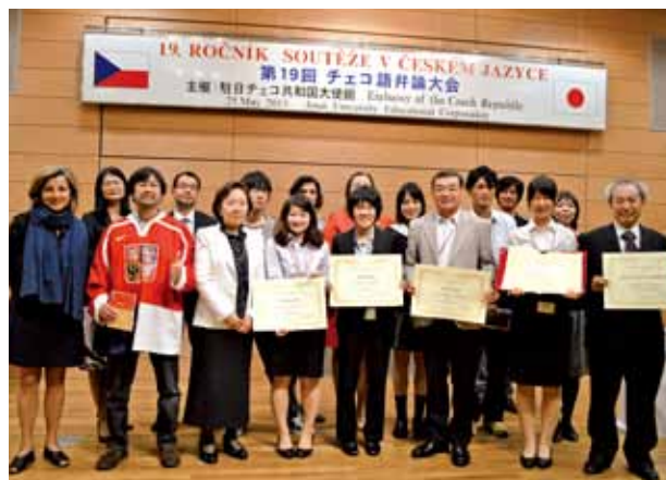
A commemorative photo with contestants and judges

To close the event, three Josai student representatives who began studying the Czech language last April took the stage to give greetings and announce their aspirations for the future in Czech. We have great expectations for these students in terms of their improvement in the Czech language and ability to promote global communication.