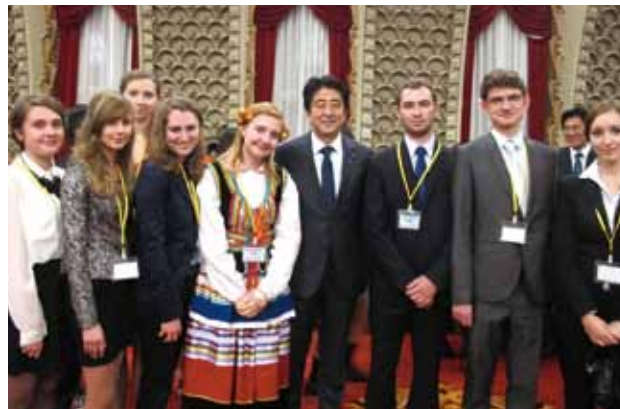
Gathered around Prime Minister Abe

before an audience that included the Poland Deputy Prime Minister and Minister of Finance Janusz Piechociński, Ambassadors and their spouses from both Poland and Ireland, and Diet members from both the Japan-Poland and Japan-Ireland Friendship Parliamentarians' Union. During their presentation, the students explained how each of them became interested in Japan and used a bus as a model for their "mobile cultural center" to illustrate their proposal for the further advancement of Japan-Poland cultural exchange, receiving an enthusiastic round of applause from the audience.