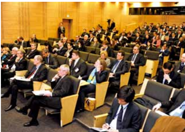
Participants from 22 different foreign embassies