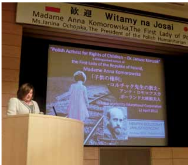
The First Lady greeting the audience

We hope that this official visit by the First Lady will lead to more active exchanges between Josai and universities in Poland in the future.