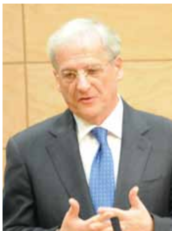
President Sólyom during his lecture

The President started his speech by stating that university is a place where he feels like home. The President continued that the scholarship from the University is certainly an unforgettable present, especially because this year marks the 140 th anniversary of Japan-Hungary amity. The President hoped that Josai would provide a role model for mutual exchanges between Japan and Hungary and also added that he would personally support exchange activities between Josai and Hungary from now on.