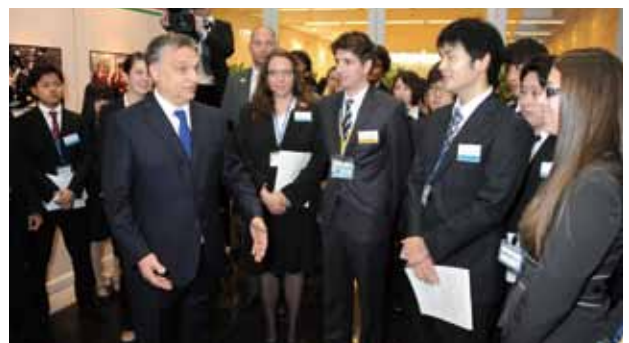
Prime Minister Orbán interacts with students

Finally, based on Josai's academic achievements in the study of Hungary and other parts of Central Europe, academic exchange, human resource development, and undergraduate and graduate education, the establishment of The Josai Institute for Central European Studies on the Tokyo Kioicho Campus was announced to promote joint research.