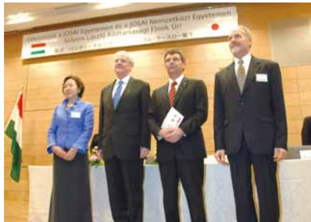
The Announcement of Mizuta Hungary Scholarship