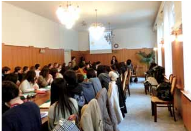
Opening day orientation at Budapest Business School