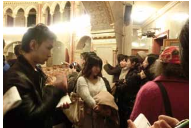
Tour of National Diet building