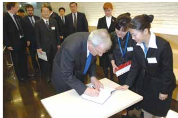
The President signs his book

Josai is currently running a number of exchange programs with Hungary such as short term study in Budapest, interchanges between students through remote relay, lectures by Hungarian writers, and more. As a result, over 230 students have taken Hungarian language courses. The President's visitation to Josai will further accelerate these exchange activities of the University and hold up its dedication to educate and produce those who would play vital roles in developing relationships between Japan and Hungary.