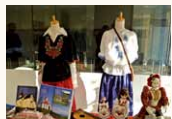
A view of the "Josai's Exchange with Hungary"

In conjunction with Hungarian President Viktor Orbán's visit to Josai, the Mizuta Museum of Art Gallery, located in the 3 rd building of Tokyo Kioicho Campus, held a special photography exhibit entitled, "Josai's Exchange with Hungary." This exhibit featured photographs that introduce Hungary's beautiful urban scenery and depict the Josai delegation's visit to universities in Hungary, as well as those that show the history of Josai-Hungary student exchange and the many Hungary-related symposiums and events that have been held at Josai over the years. The photographs were accompanied by displays that highlight Hungary's unique culture including music, musical instruments, visual art, and literature.