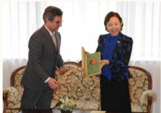
Awarding of the Pro Cultura Hungarica of the Republic of Hungary