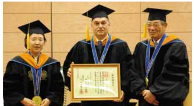
Prime Minister Orbán receives his honorary doctoral degree

After the ceremony, Prime Minister Orbán gave a special lecture to commemorate his visit, entitled "Hungary and Europe in a Changing World." In his speech, the Prime Minister addressed Hungarian infrastructure in the modern age, economic change, and the European history that has influenced these developments, as well as his thoughts for the future. He also included messages for the future generation of young leaders, providing his perspective on the last 25 years of Hungarian history based on his own experience as a leader who worked at the front line of political reform. Nearly 150 attendees sat in rapt attention during Prime Minister Orbán's lecture, including