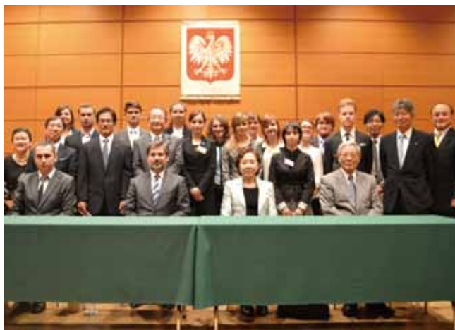
Commemorative photo with participants