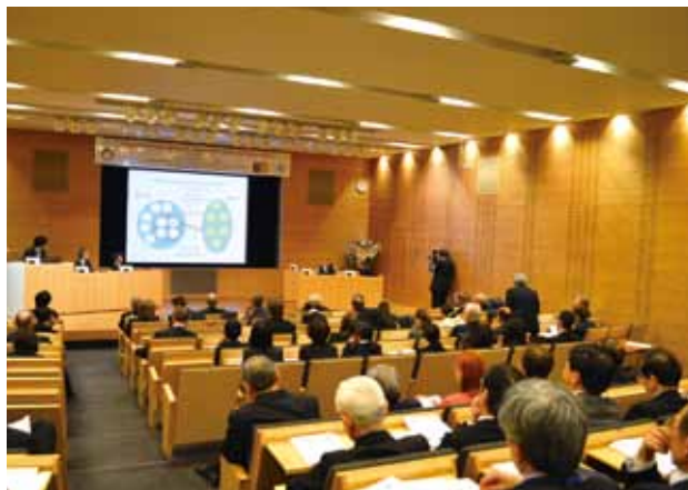
A view of the seminar