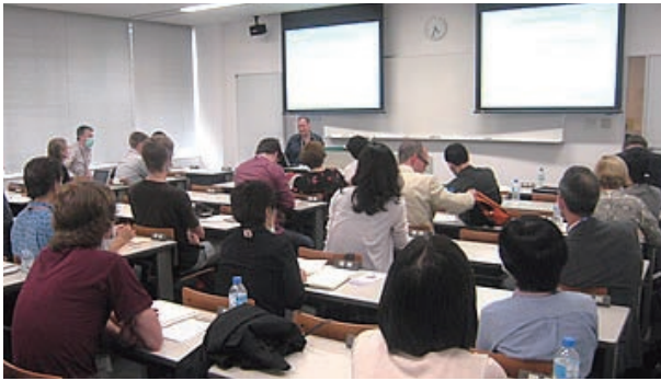
Declaration for the Formation of a Network

On Saturday, May 23rd, 2009, the International Film and Media Workshop was held, hosted by the Media Studies Department at the Kioicho Campus in Tokyo.