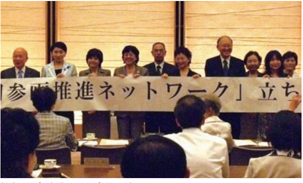
Declaration for the Formation of a Network

Date: July 3rd, 2009 Place: Prime Minister's Residence