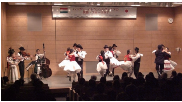
Hungarian Ethnic Dance Performance

with those three countries made it a fitting lecture for the Japan-Danube exchange year project. In the second section, that presented a richness and variety of ethnic dances and musical performances, the