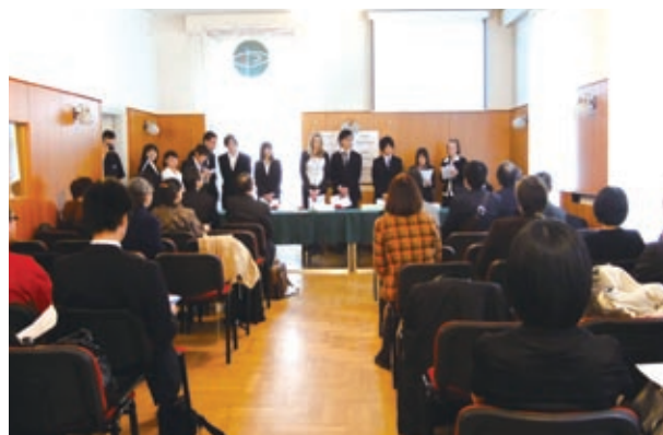
The collective presentation by students from the two institutions

On the next day the presentation on collective research by Josai students who came to visit Budapest Business School on Mizuta Scholarship and students of Budapest Business School was held. The presentation, given both in Japanese and English, looked into the youth culture of Japanese and Hungary from a comparative perspective; although students worked for the presentation with time restraint, they certainly displayed their collective efforts. At the reception after the presentation, students said that the study tour genuinely stimulated them to learn Hungarian language and history more actively and eagerly study English.