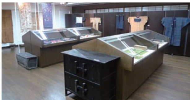
"Women's Handwork Exhibition" in the gallery on the third floor of the Administration Building of Josai International University

Researches and studies on how handworks such as dyeing and clothes making, which have traditionally been regarded as women's work in Japan and other Asian and African regions, have changed because of modernization and how, in turn, the position