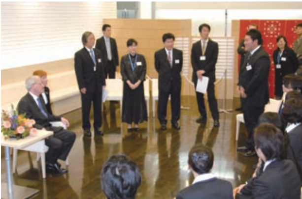
Conversation with the President

Josai is currently running a number of exchange programs with Hungary such as short term study in Budapest, interchanges between students through remote relay, lectures by Hungarian writers, and more. As a result, over 230 students have taken Hungarian language courses. The President's visitation to Josai will further accelerate these exchange activities of the University and hold up its dedication to educate and produce those who would play vital roles in developing relationships between Japan and Hungary.