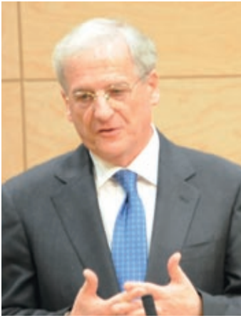
President Sólyom during his lecture

process in a compelling fashion, from his active participation in people's movements as a jurist to the establishment of the Constitutional Court and his time as a first cabinet member. After the lecture, the President took a number of questions from students from both universities and addressed each of them attentively.