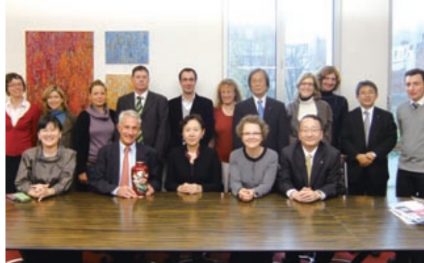
The Representatives from Lille Catholic University and Josai

On the day of agreement, the representative faculty and staff from the two institutions gave introduction to each university and discussed potential academic exchanges in detail, ranging from the Agricultural Studies, Environmental Studies, Medical and Welfare Studies to Business-Communications Center.