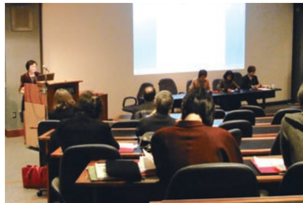
Three graduates from JIU present their papers