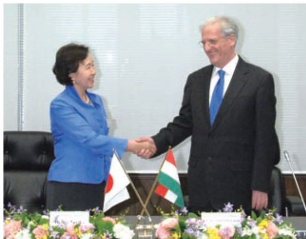
Greeting the Hungarian President Sólyom

Entitled "A Revolution based on Law: Twenty Years after Hungary's Democratization," the President's special lecture recounts the President's personal involvement with Hungary's democratization