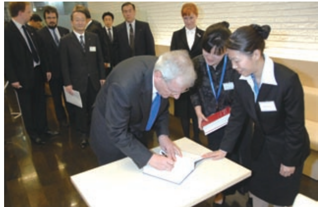
The President signs his book