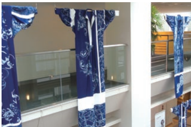
Artworks displayed at the exhibition

Researches and studies on how handworks such as dyeing and clothes making, which have traditionally been regarded as women's work in Japan and other Asian and African regions, have changed because of modernization and how, in turn, the position