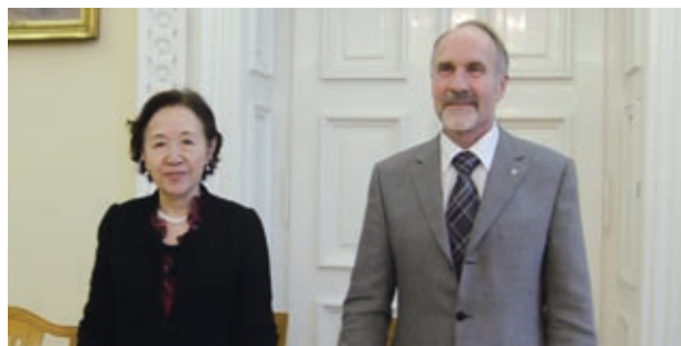
After the signing ceremony

The Rector himself gave a presentation on the university, explaining that the university was established through the consolidation of a number of universities in the year 2000 and introducing its Hungarian, English and German courses, international student population, and main research areas.