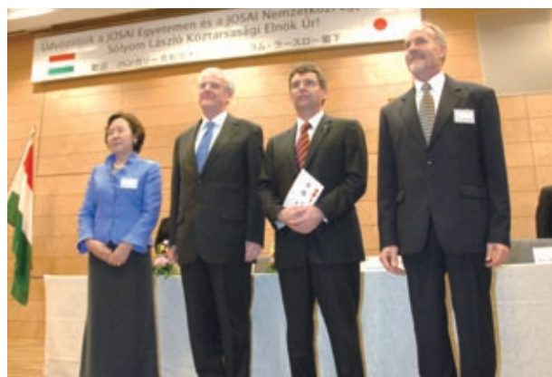
The Announcement of Mizuta Hungary Scholarship