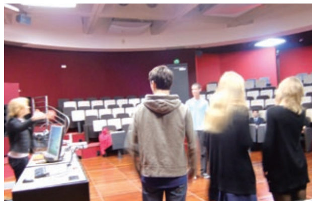
Students in the presentation course

What particularly impressed the representatives from Josai during the visit to the campus was a course designed to support students to improve their presentation skills. We look forward to a day when Josai students benefit from this unique, exciting course.