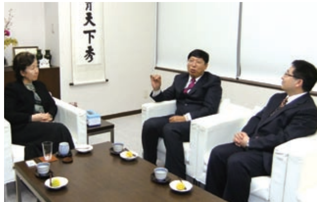
Chancellor greets the President of Tianjin Foreign Studies University

Becoming a university in China is not an easy task as it involves a lot of regulations to fulfill and procedures to go through. Hence we congratulate on TFSU's achievement and look forward to more academic exchanges with them.