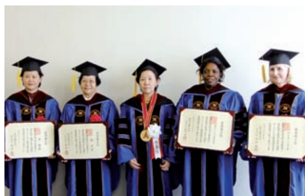
Honorary doctoral degree