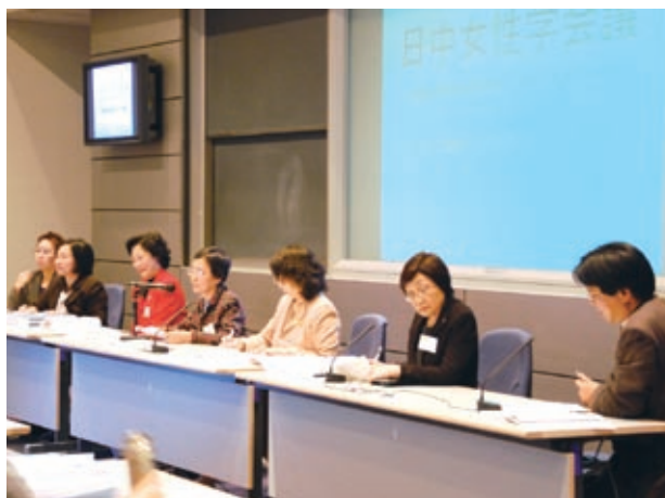
At the panel discussion