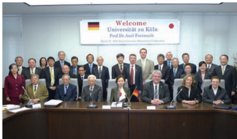
Faculty members from the two institutions

Mathematics and Natural Sciences, Arts and Humanities, and Human Sciences). We expect a variety of academic exchanges such as the exchange student program with the University of Cologne.