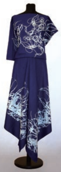
A work of Moholy-Nagy University of Art and Design, Hungary

Indigo dyeing techniques, which have traveled from Asia to Europe, spread as a traditional culture of German immigrants in Hungary in the 17th century, and are now recognized as traditional textile art.