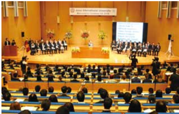
The scene at Mizuta Memorial Hall with incoming students from all over the world

This Fall's entering class consisted of exchange students from a variety of different countries including: China, Taiwan, Korea, Vietnam,