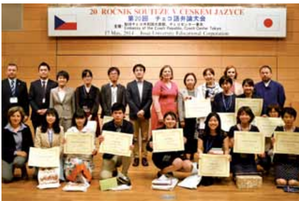
A commemorative photo following the competition

Place: Josai University Educational Corporation, Tokyo Kioicho Campus