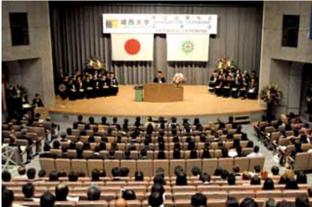
A view of the ceremony