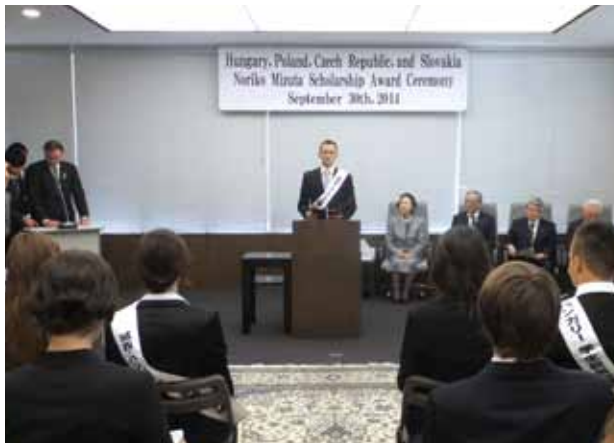
Fellowship class representatives expressing their gratitude