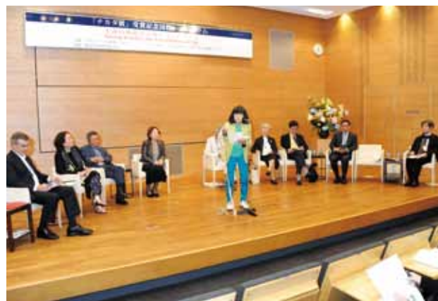
The scene during Panel 3