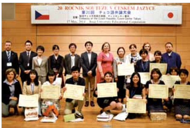
A commemorative photo following the competition

Place: Josai University Educational Corporation, Tokyo Kioicho Campus