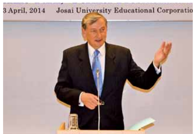
Former President Türk during his lecture

To this point, Josai University Educational Corporation has worked actively for the promotion of student exchange and the cultivation of human resources in Central Europe, earning many accomplishments in the realm of education and cultural exchange in the process. The Josai Institute for Central European Studies was established to promote even further the development of joint research, academic exchange, human resources, and undergraduate and graduate education in this region. With former President Türk's visit to Josai, we hope that our program of exchange with Slovenia will become even more active.