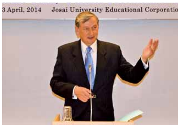
Former President Türk during his lecture

To this point, Josai University Educational Corporation has worked actively for the promotion of student exchange and the cultivation of human resources in Central Europe, earning many accomplishments in the realm of education and cultural exchange in the process. The Josai Institute for Central European Studies was established to promote even further the development of joint research, academic exchange, human resources, and undergraduate and graduate education in this region. With former President Türk's visit to Josai, we hope that our program of exchange with Slovenia will become even more active.