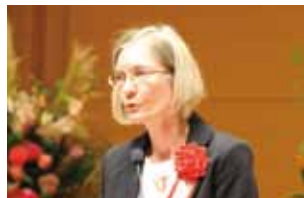
Councilor Györgyi Juhász of the Embassy of Hungary