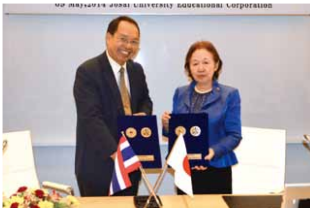
Signing the academic exchange agreement

Place: Josai University Educational Corporation, Tokyo Kioicho Campus