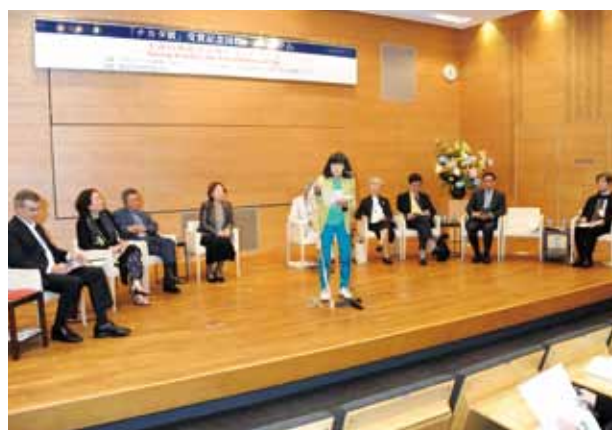
The scene during Panel 3