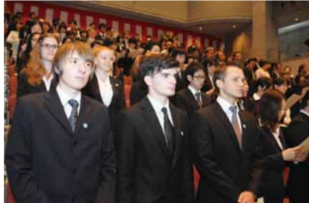
Josai students from all over the world