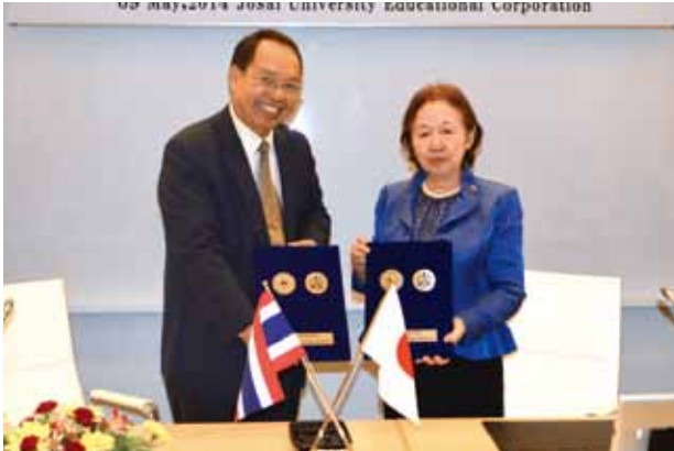
Signing the academic exchange agreement

Place: Josai University Educational Corporation, Tokyo Kioicho Campus