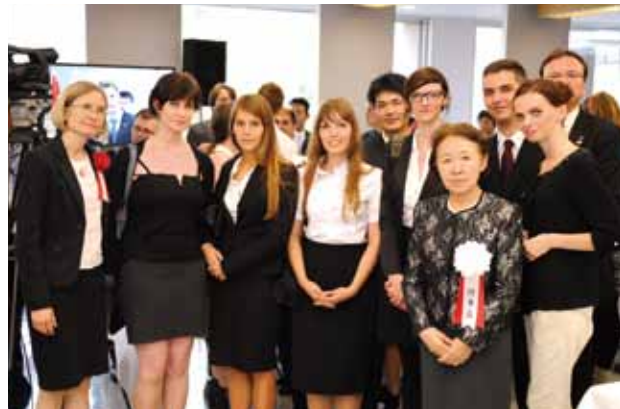
The alumni association meeting following the ceremony

Thailand, the Philippines, Pakistan, USA, Canada, New Zealand, Spain, Norway, Hungary, the Czech Republic, Poland, and Slovakia, lending the ceremony a distinctly international flavor.