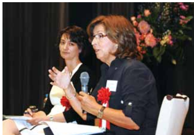
A view of the symposium