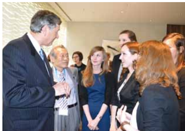
Former President Türk meets with students