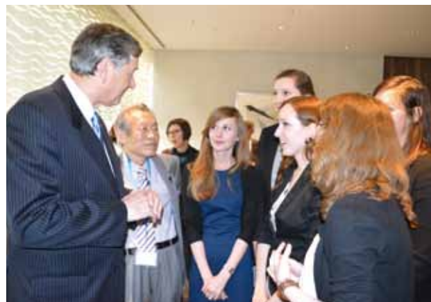
Former President Türk meets with students