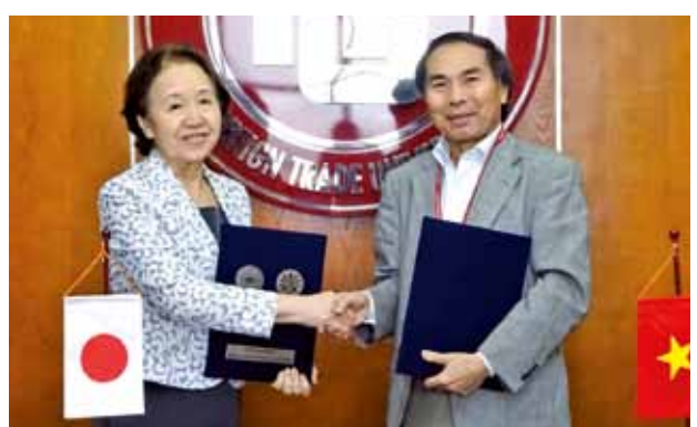
With FTU president