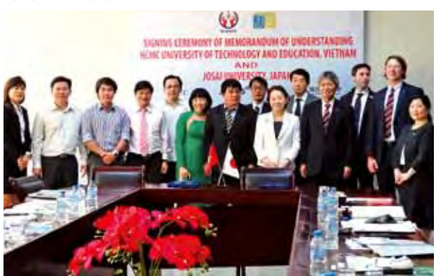
Commemorative photo at the signing with HCMUTE