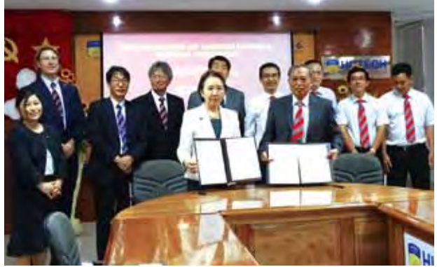
Exchange agreement signing at HUTECH