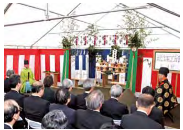
Groundbreaking of the Awa Global Village

With the construction of the AGV, Josai hopes to foster human resources in the field of tourism that possess a global worldview, while encouraging greater interaction with members of the local community.