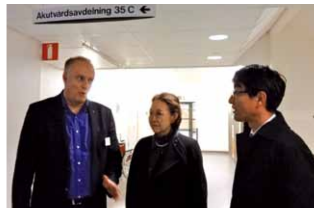
At the Uppsala University Hospita

Afterwards, we listened to the overview in the seminar room. They explained how each building has different departments and that this hospital especially excels at plastic surgery treatment, etc. After the explanations, a Q&A session was held in connection to the difference of the insurance system between two countries, including differences in medical cost and medical systems in Japan and Sweden, etc.