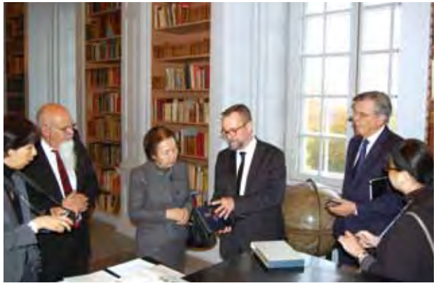
With writings of Harry Martinson's in hand at the CAROLINA REDIVIVA of Uppsala University

There are 12 libraries in the oldest university in Northern Europe. We were guided to the oldest library area, which is the main library area. A museum is located on the first floor of the building, exhibiting a number of valuable pieces, including a bible made of silver, a musical score of "Die Zauberflöte" by Mozart, etc. Other areas are modern browsing rooms for students, and many students were entering and leaving the areas.