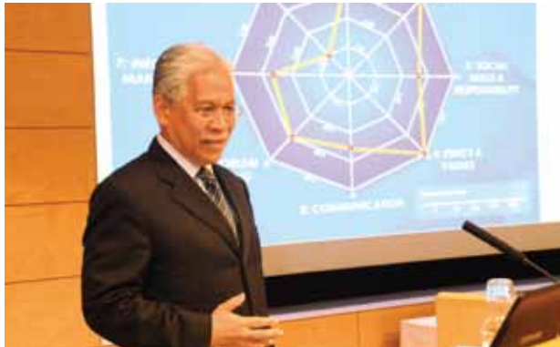
Minister of Higher Education Idris bin Jusoh delivers his lecture

In a lecture entitled, "Scenario of Higher Education in Malaysia," Minister Idris bin Jusoh detailed the current state of university education