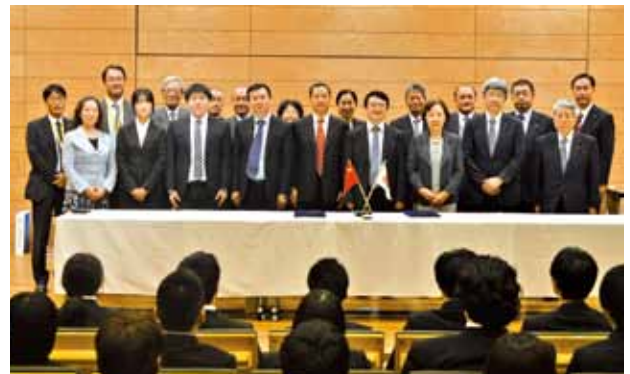
Commemoration photograph after the signing of the agreement