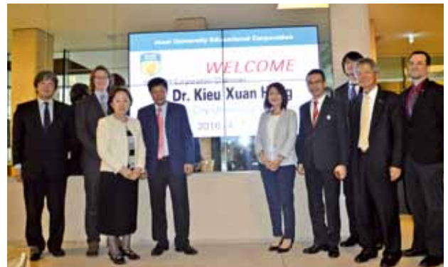
Visits of Ho Chi Minh City University of Technology at Tokyo Kioicho Campus

We hope that their visit and discussions will lead to greater exchange of students, faculty members and administrative staff.