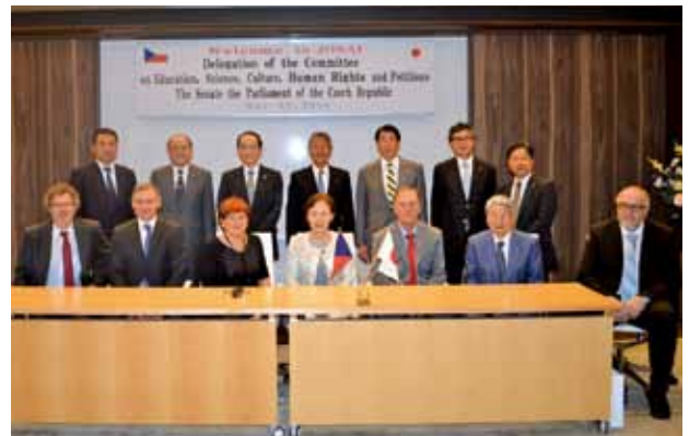
A commemorative photo with meeting participants