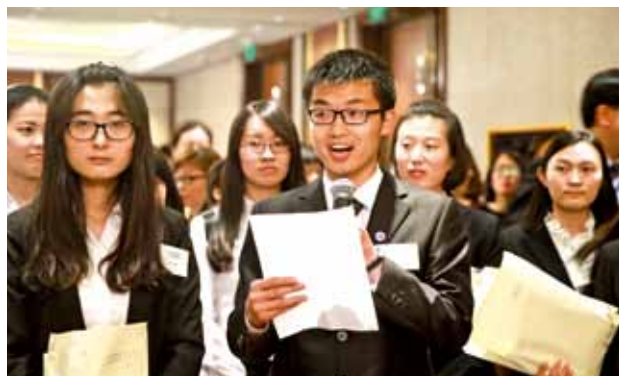
Scholarship students deliver their speeches