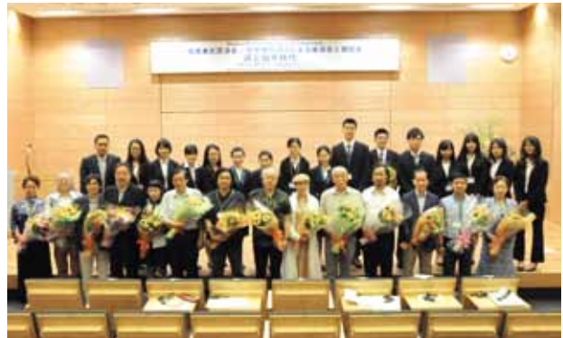
Receiving bouquets from exchange students