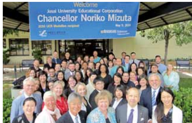
A very warm welcome by all the administration and staff

More than 3,200 Josai University and Josai International University students have had the opportunity to participate in short and long-