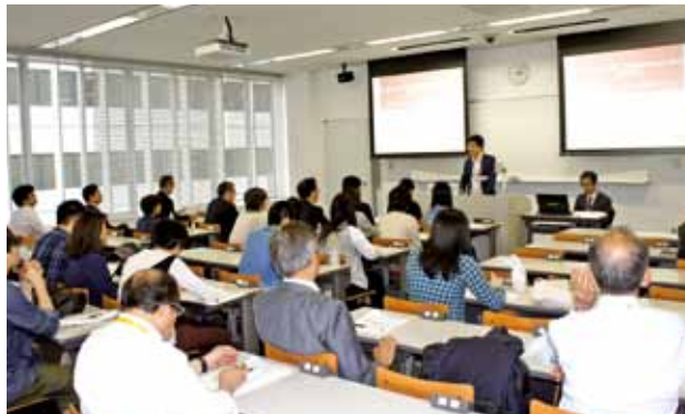
The seminar in progress