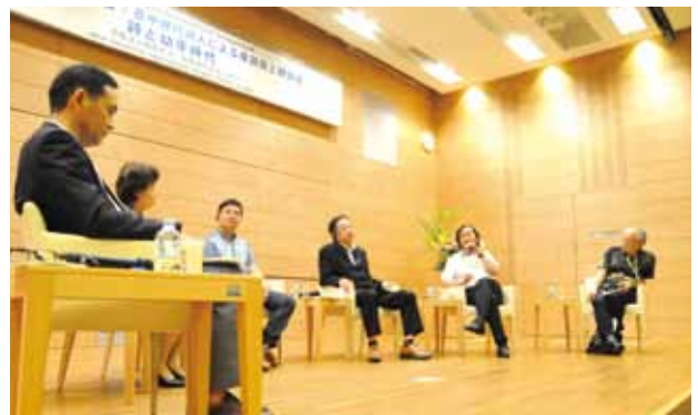
The roundtable discussion in progress