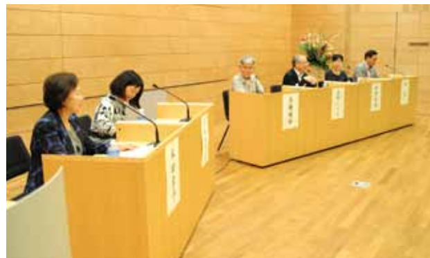
A view of the symposium