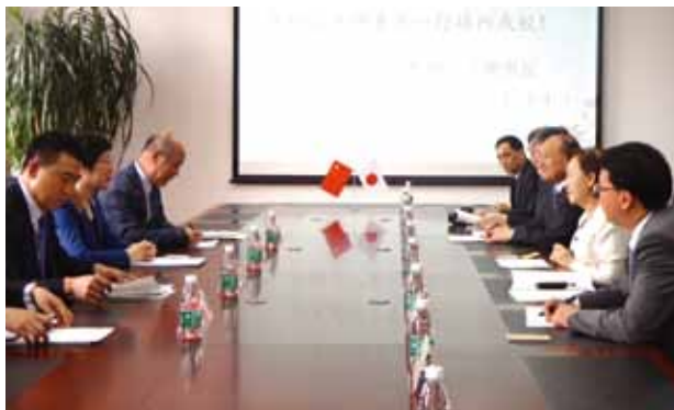
Josai visits the Dalian University of Foreign Languages