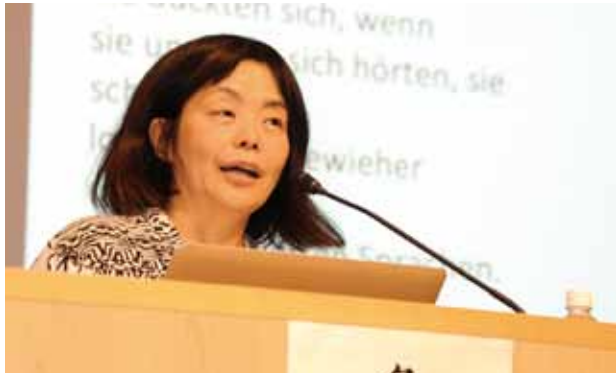
Ms. Tawada gives her lecture