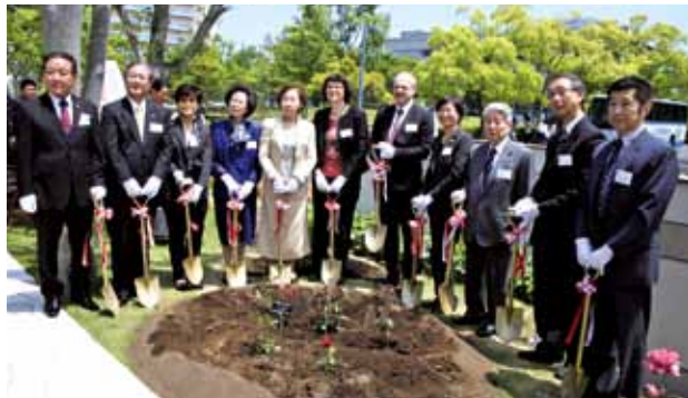
Commemorative photo of tree planting