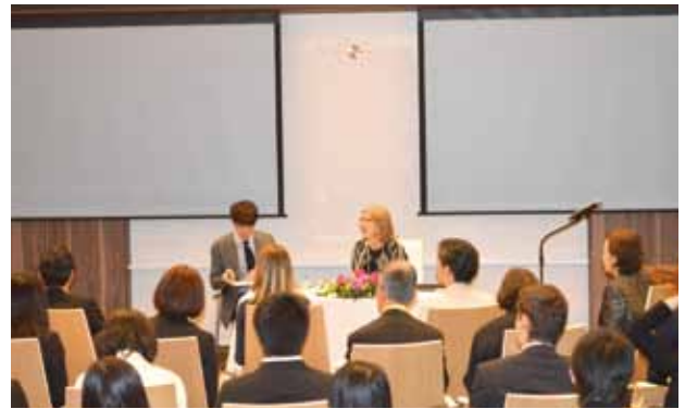
European Cafe at Tokyo Kioicho Campus

Her talk encompassed many topics including her discovery of Japan, cultural differences between France and Sweden, food culture, family communication and the balance between public/private lives. She also