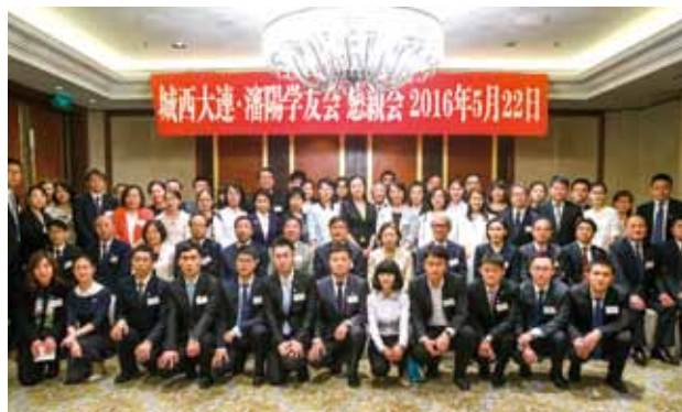
Group photo for the alumni association meeting

Alumni who assembled for this meeting expressed their gratitude to their mentors and home institutions and pledged to continue working for the continued development of their universities and the fostering of China-Japan cultural understanding.