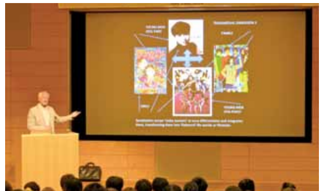
Audience members listen with rapt interest