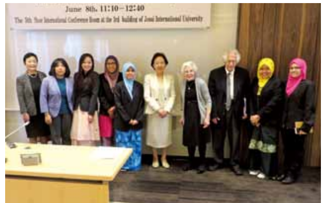
A commemorative photo with Malaysian exchange students following the morning lecture