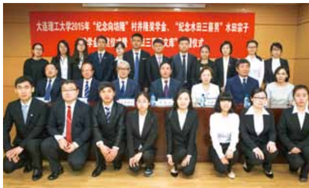
With the scholarship recipients