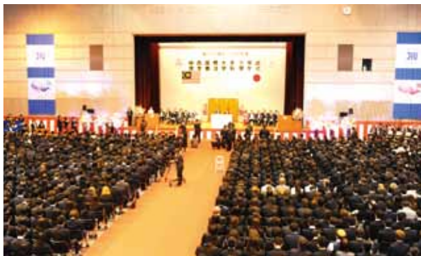
A packed Sports Culture Center