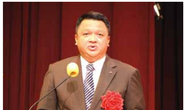
His Highness Crown Prince Tuanku Syed Faizuddin Putra Jamalullail offers his congratulations